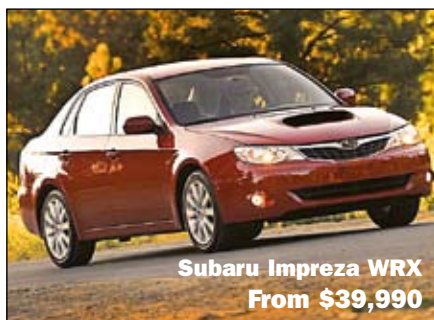
Subaru Impreza WRX From $39,990

Subaru have put the bite back into “Rex” with the arrival of the sedan. Upgrades include an extra 26kW of